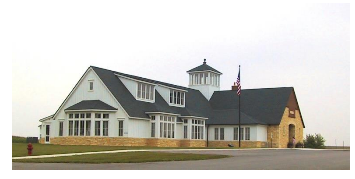
Huntley Area Public Library opened 1999