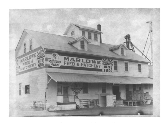
Marlowe Feed & Hatchery 1945 – 2011 at this location