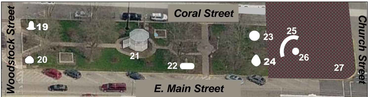
Huntley Town Square Detail Map